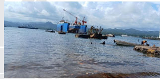
Pawl rack delivery and installation on 500T Slipway

Attention has now shifted to below-water works, which are currently underway. Ongoing activities include hydro-demolition, concrete breakouts, installation of anodes, and continued rail installation. The rehabilitation project is a key initiative aimed at strengthening infrastructure reliability and ensuring the slipway continues to meet operational and safety standards. Work is expected to continue until all underwater components are fully completed.