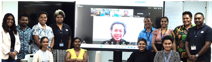
FPCL employees successfully completed their training with the external audit body, Det Norske Veritas (DNV)

A multi-disciplinary team of 15 employees across FPCL's different departments and units were selected to undertake an Integrated Management System (IMS) internal auditing training delivered virtually by FPCL's external audit body, Det Norske Veritas (DNV) from 18th –20th February 2026. The training aimed to strengthen internal audit capabilities and enhance compliance with management system requirements across the organisation. Participants gained valuable knowledge on audit principles, risk-based thinking, and the effective implementation of integrated standards, further supporting continual improvement and strengthening governance within operational processes.