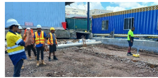
Shed 3 NDM (Nuclear Density Meter) testing

and workplace safety. The project continues to move forward as part of ongoing efforts to improve infrastructure quality and operational efficiency.