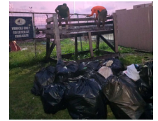
FPCL staff at Levuka