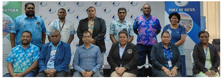
Stakeholders at Suva Ports Head Office in Walu Bay, Suva

partnerships, enhance preparedness, and support continuous improvement in port security management.