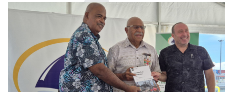
FPCL Board Chairman, Hon. Prime Minister and the Australian High Commissioner to Fiji at the launch of the Port Master Plan in Lautoka