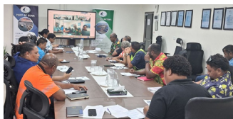
International Stakeholders Meeting at Lautoka Port

Key discussions focused on operational performance, infrastructure developments, safety and compliance matters, and upcoming initiatives aimed at supporting growing trade demands. FPCL reaffirmed its commitment to continuous stakeholder engagement, recognizing the vital role that collaboration plays in driving improvements, supporting economic growth, and maintaining Fiji's position as a key maritime hub in the region. The quarterly meetings remain an important avenue for fostering transparency, building trust, and ensuring that all stakeholders are aligned in achieving shared goals for the port industry.