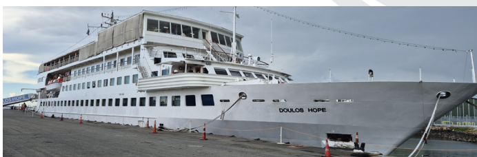
Doulos Hope berthed at Lautoka Port

Doulos Hope , known for its mission of sharing knowledge, literature, and hope through its onboard floating book fair, offered visitors the opportunity to explore a wide selection of affordable books and engage with an international crew representing diverse cultures and backgrounds. The official opening not only celebrated the arrival of Doulos Hope but also reinforced FPCL's commitment to supporting initiatives that promote education, cultural exchange, and positive community impact through Fiji's port network.