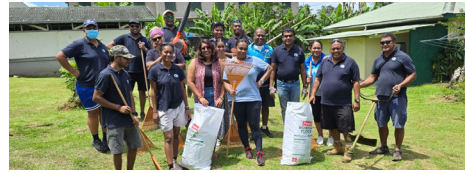
FPCL staff at Golden Age Home in Suva

compassion, and active community engagement among its staff.