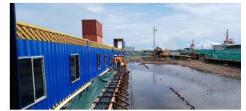
Shed 3 Sidewalk work in progress