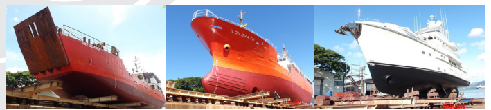
Government Shipping vessel LC Vatulawa on slipway (left) and Iloilovatu (center) and Yacht Voyager (right) on slipway for maintenance

In addition, FSHIL successfully undertook repairs on a local yacht, Voyager, further demonstrating its capability to service a diverse range of vessel types. The company's 500-tonne slipway is currently undergoing repairs and is expected to be fully operational by May this year. Once completed, this upgrade will significantly enhance FSHIL's operational capacity, enabling it to accommodate a greater volume of vessel repair and maintenance work.