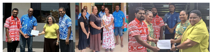
FSHIL staff visited St Philomena's Home in Nailuva Road, Suva, St Christopher's Home in Nakasi and Dilkusha Home in Nausori.

FSHIL concluded its Christmas Charity initiative on 23 January 2026 with visits to three orphanages—St Philomena Home, St Christopher's Home, and Dilkusha Home—each receiving a $700 donation raised during its December 2025 Christmas event. The visits allowed staff to personally deliver contributions and spend meaningful time with children, fostering compassion and strengthening community connections. This initiative highlights FSHIL's commitment to social responsibility, with plans to continue the charity drive annually to support vulnerable children.