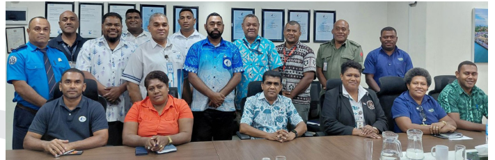
Stakeholders at Lautoka Port