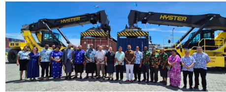
The Hon. Prime Minister at the official opening of the Yard 4 project in Lautoka

Fiji Ports also acknowledged the support of key partners, including the Australia Infrastructure Financing Facility for the Pacific, alongside government agencies, consultants, and contractors who contributed to delivering the projects. The completion of Yard 4 underlines Fiji Ports' ongoing commitment to building resilient infrastructure, facilitating trade, and strengthening Fiji's position as a regional maritime hub.