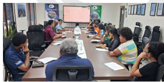
Local Wharf Stakeholders Meeting at Lautoka Port