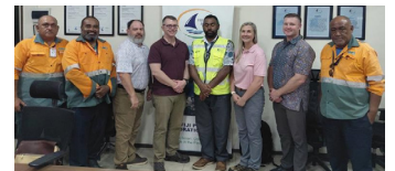
US Coast Guard Audit team at Suva Port (left) and at Lautoka Port (right)