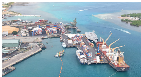
Lautoka Port Maintenance Dredging Project

The Lautoka Port Maintenance Dredging Project has reached a major milestone, with the contractor confirming the completion of dredging works. To verify the dredged volumes and ensure compliance with project specifications, the Fiji Navy conducted a post-bathymetry survey, which was successfully completed on 14th February 2025. The survey results will provide critical data on the effectiveness of the dredging operations. This maintenance dredging is essential for ensuring safe navigation, optimizing port operations, and maintaining Lautoka Port's capacity to accommodate larger vessels.