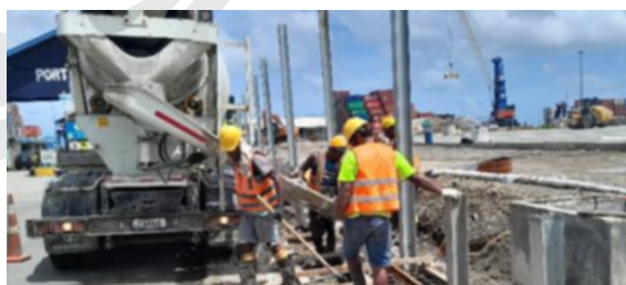
Concrete pouring on the ground beam

This upgrade is part of FPCL's commitment to strengthen port infrastructure to meet increasing demands and improve service delivery for stakeholders.