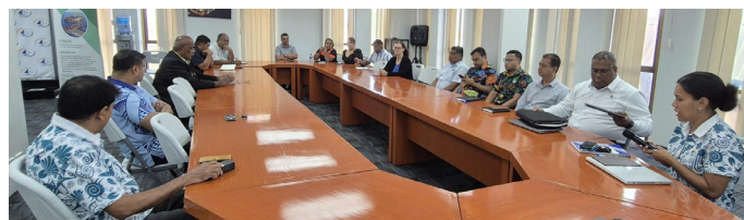
Various retailers sharing their valuable insights and feedbacks to FPCL Management

Through open dialogue and active engagement, FPCL aims to create a more business-friendly and efficient port environment that supports both economic growth and stakeholder success. The insights gathered during the consultation will inform future strategies, ensuring that the needs of retailers are integrated into FPCL's planning and development initiatives. FPCL remains committed to collaborative growth and looks forward to continued engagement with its stakeholders to build a stronger and more inclusive port community.