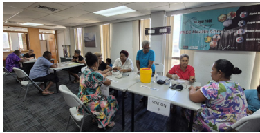
Suva Staff receiving their medical check ups

With non-communicable diseases (NCDs) being the leading cause of death globally, raising health awareness among FPCL staff is essential. These check-ups provide valuable insights, enabling employees to take proactive steps toward better health and well-being.