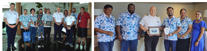
Plaque presentation onboard of Celebrity Edge on 7 th January

The new year began with the peak season for cruise ship vessels, with more than fifteen (15) cruise ships visits to both Suva and Lautoka Ports during the first quarter of 2025. Amongst these, two (2) cruise ships were on their maiden voyage to Fiji. FPCL anticipates an increase in the number of cruise ship vessels visiting Fiji this year, when compared with 2024.