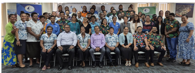
FPCL Suva Staff and Executive Management during the 2025 Staff Welcome Lunch