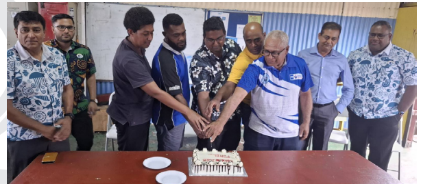
FPCL CEO together with Executive Management team and FSHIL's Acting Operations Manager during staff welcome function.

Employees enjoyed an afternoon tea, setting a positive tone for the year ahead. As 2025 unfolds, FSHIL looks forward to another year of innovation, collaboration, and success in ship repair and heavy industries.