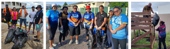
Left to right: FPCL staff from Suva, Lautoka and Levuka assist with the clean up initiative, organized by the Ministry of Environment & Climate Change

As an advocate for environmental stewardship, FPCL has earned both international and local recognition for its sustainability efforts. Engaging in initiatives like National Clean-Up Day reflects its commitment to corporate social responsibility while fostering teamwork and unity among employees. With clean-up activities organized across major towns and cities, FPCL teams in Lautoka, Suva, and Levuka actively participated, demonstrating their strong support for this vital cause.