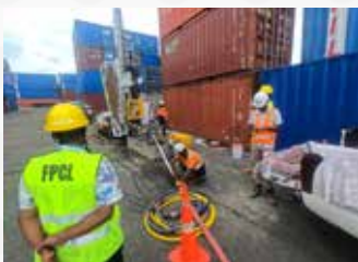
FPCL Staff observing geotechnical investigations at Kings Wharf

Works for the geotechnical investigation of the King's Wharf Sheet Pile Walls commenced on 30th January 2023. Based on the Project Scope of Works, Consultant's contractor will conduct Cone Penetrometer Tests with Pore Pressure Measurements and Rotary Cored Boreholes at various specified locations on King's Wharf. From the samples taken, the Consultant will then conduct lab tests and assessments and produce a Factual Report for FPCL to use for the Wharf Rehabilitation Project Package A: King's Wharf & Walu Bay Wharf.