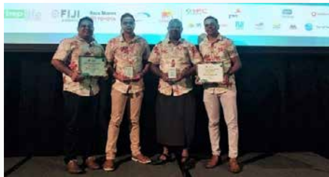
Human Capital Services Team receiving awards at the FHRI convention

For the first time, this year Fiji Ports made submissions in "Excellence in Learning & Development" and "Excellence in Health & Safety" and was awarded Gold Awards in both categories. It is indeed a remarkable achievement for the entire team of FPCL.