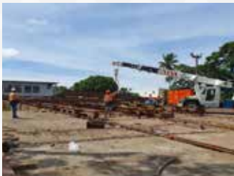
Contractor working on dismantling the 1000T Cradle

The Slipway Rehabilitation (1000T and 500T) Project for FPCL's subsidiary, Fiji Ships & Heavy Industries Limited (FSHIL) commenced on 27th February 2023. The contractor has initiated site mobilization with works currently underway on the 1000T slipway including site set-up, dilapidation survey, the disassembly of the 1000T cradle and removal of pawl tracks. Rehabilitation of the 500T slipway will commence after works on the 1000T is complete. The project has an estimated duration of 251 days, and the expected completion is late 2023.