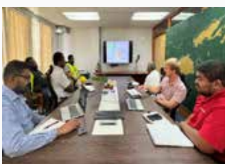
Consultant presentation to FPCL Projects, Asset & Engineering Team

The Consultant for the Muaiwalu 1 Tenants EFL Account Transfer Project completed the site investigation and production of the 'as-built' Electrical Plans of the current electrical infrastructure at Muaiwalu I. The Assets and Engineering team assisted the Consultant with the site investigations and cable tracing with the consultant presenting the draft 'as-built' to FPCL on 2nd March. The Consultant verified the 'as-built' on 14th March with the assistance of the Assets and Engineering teams and the project is expected to progress to the approval of the 'as-built' and initiation of the Concept Design in the next quarter.