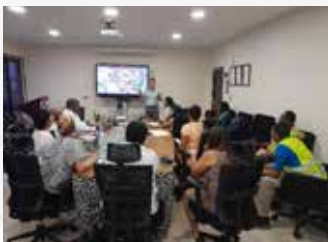
Consultations with shipping stakeholders at the Port of Lautoka

The Consultant for the Lautoka Foreshore Development project conducted the first phase of consultations with key stakeholders including local Council, operations and shipping stakeholders for the Port of Lautoka. The Consultant has also submitted the Project Inception Report after reviewing the provided resources on the project and is expected to progress to the assessment of proposed development options from mid-March to April.