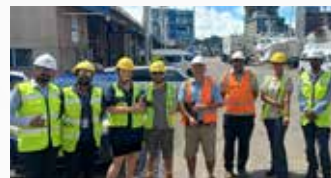
Consultants with the FPCL Projects team at the Shed 6 site inspection on 21st February

The Projects Unit facilitated the pre-bid site meeting for the Shed 6 Upgrade Project on 17th February. The project aims to refurbish the Shed 6 facility at Princess Wharf to a modern and sustainable Cruise Terminal to provide convenient and accessible services for Cruise Vessel Passengers and Crew at the Port of Suva. The team also facilitated site inspection requests from consultants with the inspection on 21st February coinciding with the visit of MSC Poesia to the Port of Suva allowing the consultants to observe cruise ship operations and movement of passengers at the Wharf. Tenders for the Project closed on 10th March with evaluations underway from mid-March.