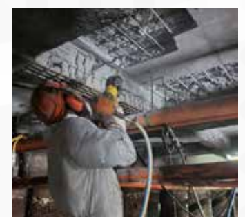
Contractor working on breakout sections at Queen's Wharf

The Queen's Wharf Rehabilitation Sub-Project continues to progress with the contractor conducting underdeck breakouts, progressing to the lower section of the wharf. The contractor has also continued the replacement of deteriorated steel components.