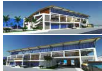
Concept design of the proposed M2 Interisland Terminal