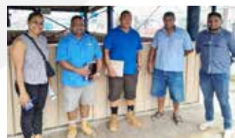
Deck coring during the Levuka Wharf site investigation.

The pre-bid site meeting for the Muaiwalu II interisland Terminal Project was held on 13th February. The site visit was a success with many interested bidders attending the meeting at the Muaiwalu II Project Site. The Project aims to develop a state-of-the-art passenger terminal for domestic travelers at FPCL's Muaiwalu II. The project is of strategic value to FPCL and will flagship FPCL's Green Port Master Plan for new developments. Tenders for the Project closed on 3rd March with evaluations commencing from mid-March.