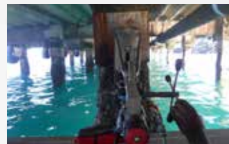
Pile coring under the Levuka wharf deck during the site investigation

The kickoff meeting for the Carbonation and Chloride Ion Content Testing for the Levuka Wharf Rehabilitation was held on 21st February 2023. Held virtually on Teams, the consultant briefed the FPCL Projects Unit and Executive Management on the Project schedule, logistics, site visit and tests they will conduct at Levuka Wharf. The Carbonation & Chloride Ion Penetration Test at the Levuka Wharf is a preliminary assessment that will determine whether the wharf structure can be rehabilitated, or a new wharf is required. If the test confirms that the wharf cannot be repaired, then FPCL will save significant cost on conducting a full wharf condition assessment and proceed directly with the Detail Design of a new wharf. Site investigation and coring was conducted on 14-15 March before the samples were shipped to Australia for testing. The factual report is expected to be completed by mid-April.