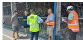
The Project Officer briefing the consultants during the site inspection