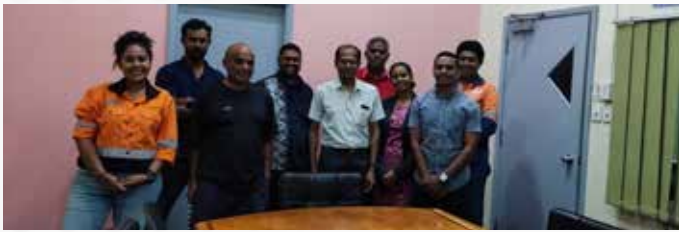
FSIL Team, FPCL Quality Assurance Officer and SLSI Auditor after successfully completing the audit