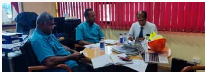
SLSI Lead Auditor auditing the Estimation Team at FSHIL.

FSHIL successfully completed its ISO 9001: 2015 Quality Management System external audit from 18th – 20th January which was conducted by Shri Lankan Standard Institute (SLSI). FSHIL completed its external audit on a high note with zero non-conformities recorded.