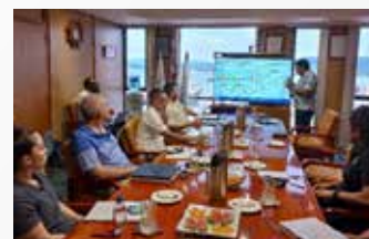
US Coast Guard having meetings with management and staff