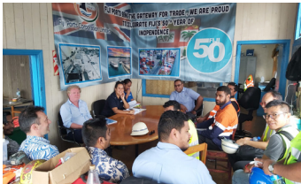
Consultant briefing before site visit.

A site visit was facilitated by the Project Unit to Consultants for the proposed Levuka Wharf Rehabilitation Project. The site visit was a success with a huge number of interested company candidates that turned up at Levuka Wharf.